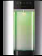
Silver - Countertop