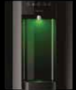
Black - Countertop