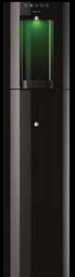
Black - Floorstanding