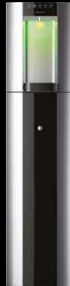
Silver - Floorstanding